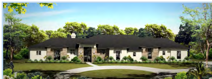
ANAQUA SPRINGS RANCH ♦ 11014 Caliza Bluff

4,274 SF | 4 Bdrm | 4.5 Baths | Large Media Rm, Formal Study, 4- Car Garage, Stunning Pool/Spa, Summer Kitchen w/ Outdoor Fireplace $1,745,000 MLS #1231762 UNDER CONSTRUCTION