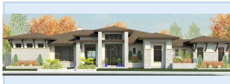
HUNTINGTON ♦ 127 WELLESLEY LOOP

On Wooded, Green Belt Lot with Stunning Pool/Spa 6,280 SF | 5 Bdrm | 5.5 Bath | Living, Study, Game Rm, Large Covered Patio with Summer Kitchen and Fireplace. 4-car garage MLS # 1213620 UNDER CONSTRUCTION