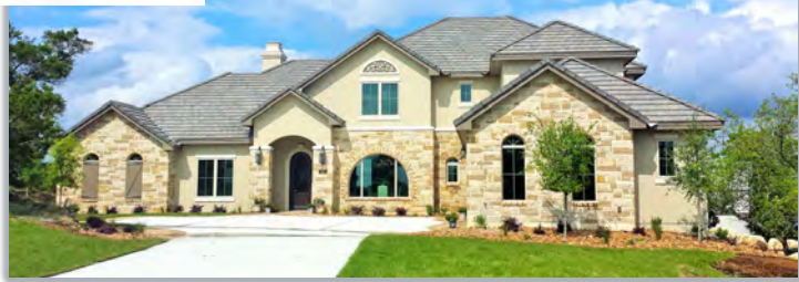
SMITHSON RIDGE ♦ 3914 SMITHSON RIDGE

4,669 SF | 4 Bdrm | 4.5 Baths | Study, Game Room, Fabulous Pool/Spa & Grotto, 3- Car Garage $1,295,000 MLS# 1226062 COMPLETED/READY FOR MOVE-IN