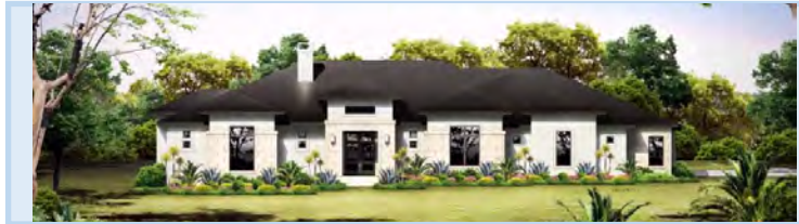
THE DOMINION (Dominion Estates) ♦ 7 Reading Lane

4,150 SF | 4 Bdrm | 4.5 Baths Game Rm, Study, 3- Car Garage $995,000 MLS # 1212723 UNDER CONSTRUCTION/NEAR COMPLETION