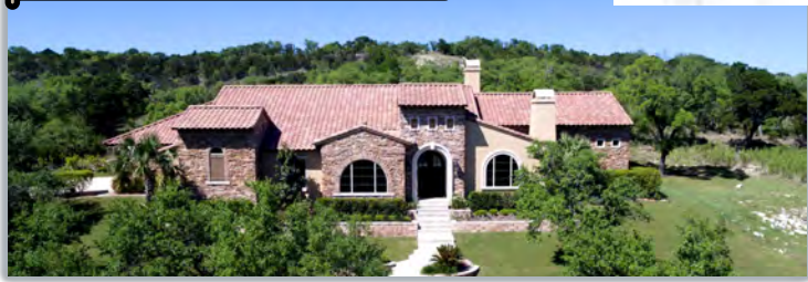
SMITHSON RIDGE ♦ 3827 Smithson Ridge

4,669 SF | 4 Bdrm | 4.5 Baths | Study, Game Room, Fabulous Pool/Spa & Grotto, 3- Car Garage $1,295,000 MLS# 1226062 COMPLETED/READY FOR MOVE-IN