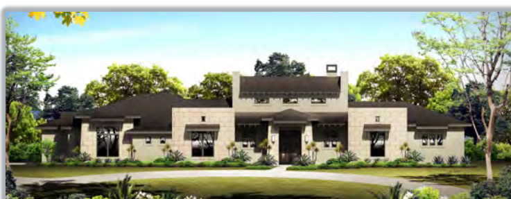
HUNTINGTON ♦ 202 Wellesley Wood New 1-Acre Estate—Just Breaking Ground!

5,781 SF | 4 Bdrm | 4.5 Bath Study, Game Rm, Flex/5th Bdrm Option $1,950,000 MLS #1192837 UNDER CONTRACT