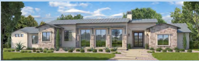
HUNTINGTON ♦ 115 Wellesley Loop

$1,850,000 CONTRACT EARLY AND SELECT FINISHES/COLORS