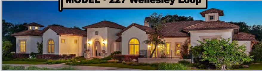
Huntington at Shavano Park

Monday - Friday 10-5 PM Saturday 11-4 PM & Sunday by Appointment Price Upon Request