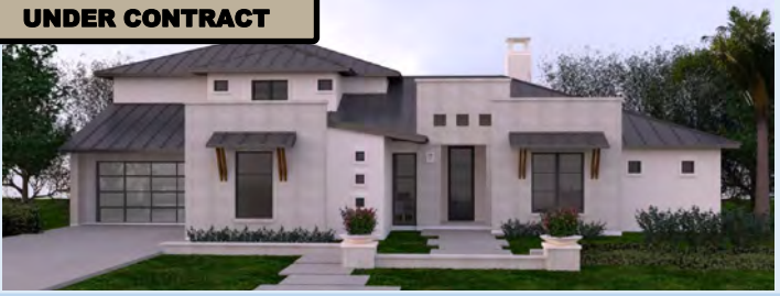
THE DOMINION (The Renaissance) ♦ 7 Kings View

Transitional/Contemporary Two-Story with Pool & Spa