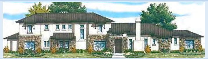
HUNTINGTON ♦ 119 Wellesley Loop

Two-Story Sophisticated Luxury on 1-Acre Greenbelt Lot