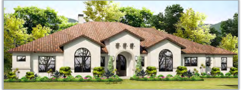
CANTERA HILLS ♦ 9827 Midsomer Place

$1,175,000 MLS# 1203902 COMPLETE/READY FOR MOVE-IN