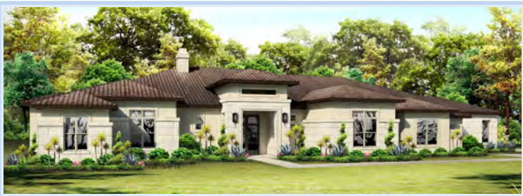
DOMINION ♦ 16 Chaumont (The Chateaux)